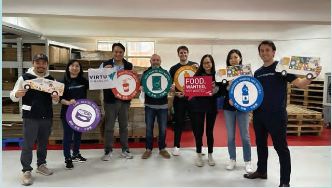
Food Parcel Packing with Feeding Hong Kong Our Hong Kong team partnered with Feeding Hong Kong to pack and distribute 500 food assistance bags to support seven local charities.

Our Palm Beach Gardens office organizes beach clean ups with local organizations to ensure we are consistently caring for our planet and appreciating the beautiful resources around us.