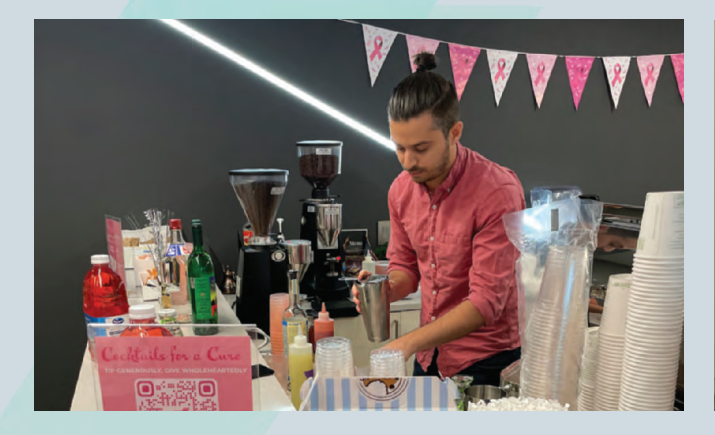
Breast Cancer Awareness Fundraising Our New York, Short Hills and London offices teamed up to host themed happy hours and fundraise for Breast Cancer Awareness, raising thousands of dollars to support research.