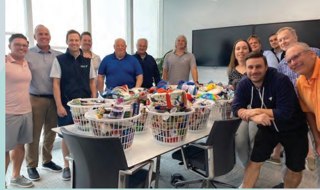
Thanksgiving Baskets Our Palm Beach Gardens office continues its commitment to providing Thanksgiving baskets as a way to connect with the community and ensure families who experience food insecurity are looked after for the holiday.